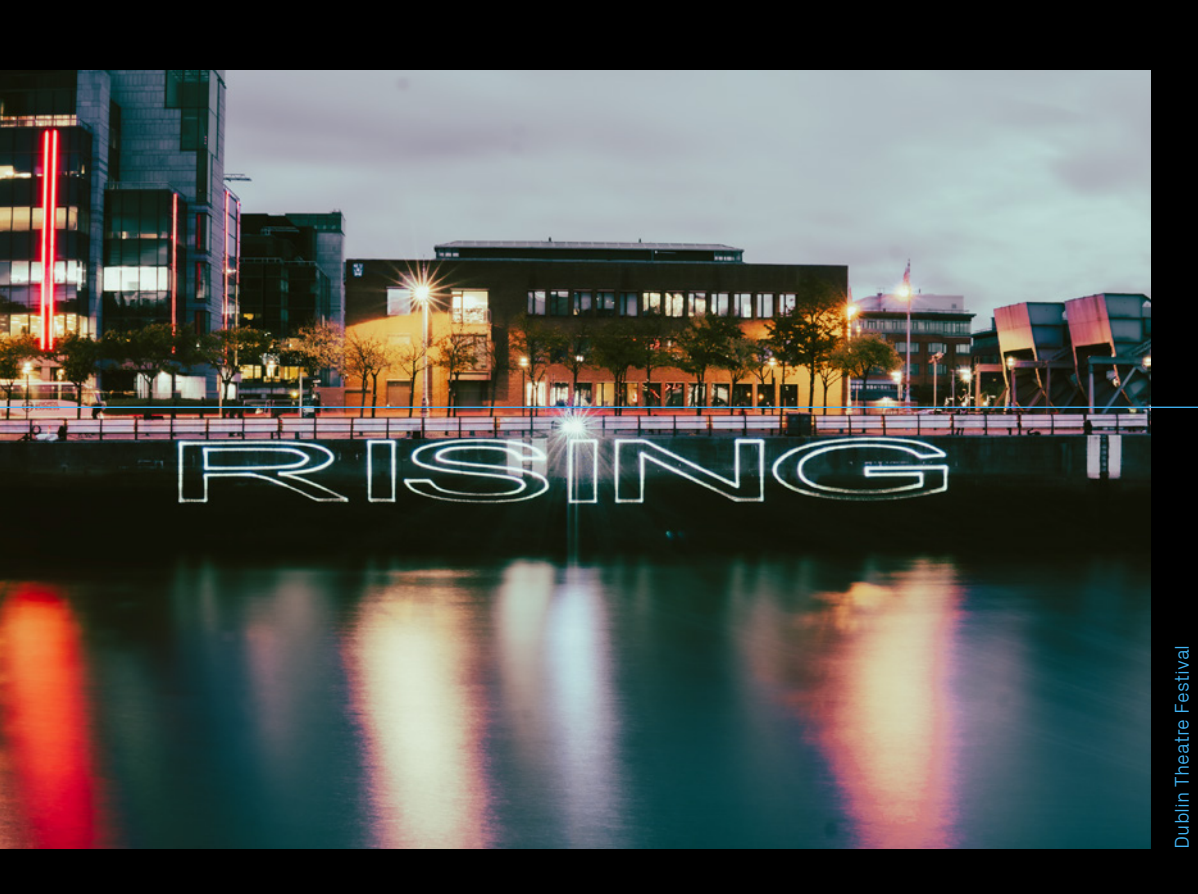
RISING in the Lir

The resulting project, RISING, ran from September 2021 until May 2022. As an active community of creative climate activists in the Dublin Docklands, RISING continues, grows and evolves. This report summarises the phases of delivery of the project, tracks the outcomes, generates insights, and makes recommendations for the future of this and similar creative community climate projects.