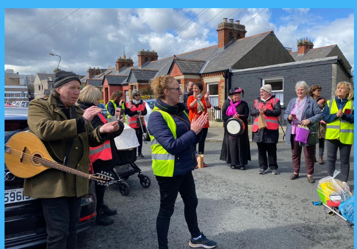
Edible Garden Launch F