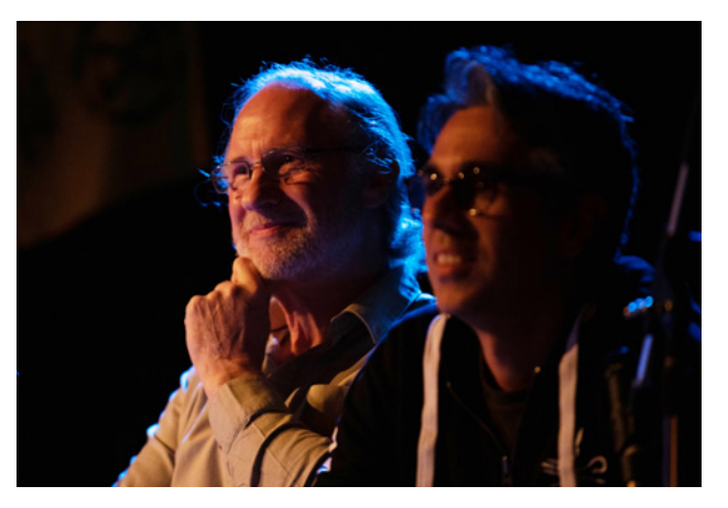
RISING in the Lir

Clearly, the collective community built through RISING and the climate actions carried out by the group have been a strong driver in shifting emotions in relation to climate change, and in many cases introducing positive emotions alongside negative ones. Research suggests that such emotional flow (a progression of multiple emotions) has an increased persuasive effect, and harnessing this may be a powerful approach in designing climate change communication (Nabi et al., 2018).<sup>14</sup>