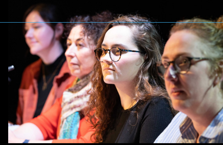
RISING in the Lir

RISING employed strategies to create accessible, intergeneration responses to local climate-related concerns. A variety of approaches were utilised in workshops and events for the public audiences and the RISING project participants: audiovisual; dialogue; creative writing; humour; academic presentations; embodied practices — walking, planting; scripted presentation.