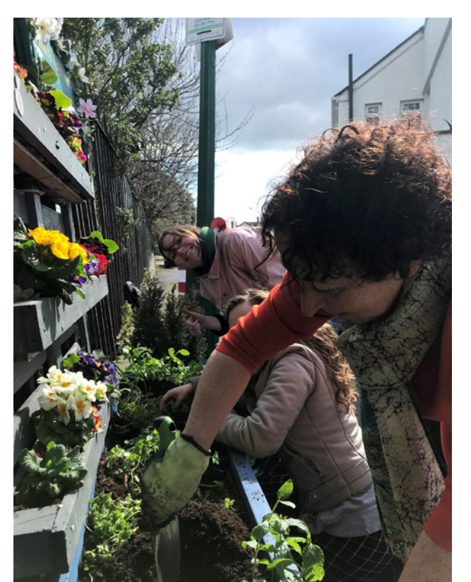
Edible garden launch event

The sub-group who wanted to tackle litter around Grand Canal Square have written to, and met with local politicians, Gardaí, Dublin City Council (South East Area Office) and the private company contracted to maintain the Square (Apleona). They have received mixed responses with some evidence of greater awareness by