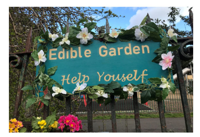
Edible Garden Launch Event

The surveyed participants were asked to consider whether they would consider taking action or making changes to your behaviour or lifestyle after participating