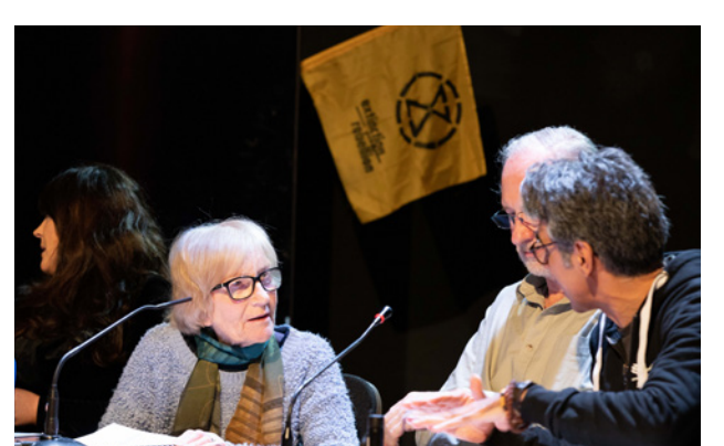
RISING in the Lir

anxiety. Sometimes it feels like a very lonely experience. I often worry that no one cares. or that my actions aren't as impactful and that can be very overwhelming. so finding people who are passionate and worried. makes me hopeful."