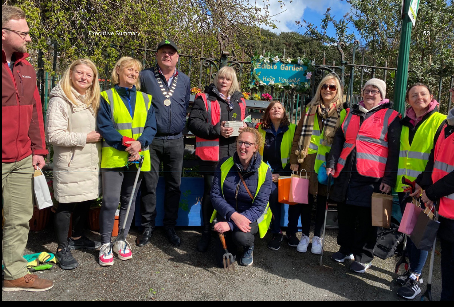
Edible Garden Launch Event

The research presented in this evaluation report sought to understand the efficacy of the creative approach to community engagement with climate action, the conditions for public engagement, and the challenges and opportunities presented throughout the project. It generates insights and recommendations for future creative community projects, within the Dublin Docklands area, and in Irish communities more broadly, presented in the section Observations and Insights. Data collected for these research studies consisted of