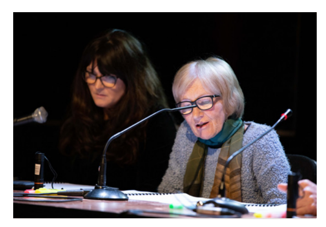
RISING in the Lir

Interestingly, all respondents selected a set of emotions from either the 'positive' side of the list (hopeful; curious; inspired; optimistic), or from the 'negative' side (angry; fearful; anxious; sad; guilty; frustrated). No respondent presented mixed selections from these two groups. However, in a post-RISING interview in May 2022, a person who had responded "fearful; anxious; frustrated" in January, while still frustrated in May, mentioned that "it brings optimism and a bit of hope when you see projects like this." Another respondent who had only responded "anxious" in January, when interviewed in May stated that they felt anxious and frustrated, but now also talked about hope: "I suppose those things can live alongside each other. You can be anxious and hopeful, frustrated and hopeful." Another who responded only "fearful" in January found that encountering new people and seeing the level of enthusiasm for climate action among the young people in the group led to a shift in their feelings about climate change: "A little bit sad, I'd say with what's going on. But more hope. And optimistic from it. Yeah, I was probably starting off a bit angry and pissed off and nobody's doing that. But then I came away hopeful, knowing that it was actually young people in the workshop that care. So that was an eye opener for me."